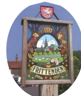
Frittenden Parish Council