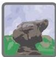
Rusthall Parish Council