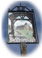
Bidborough Parish Council