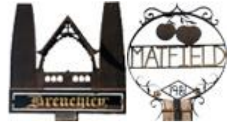
Brenchley and Matfield Parish Council