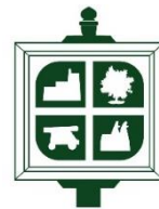
Horsmonden Parish Council